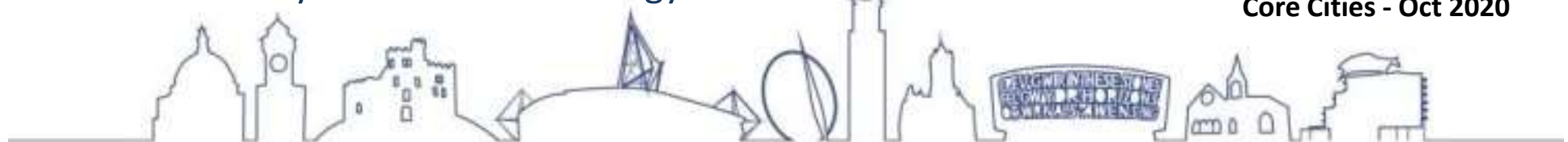
Core Cities - Oct 2020