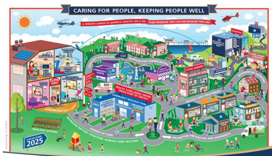
Cardiff and Vale University Health Board Shaping Our Future Wellbeing Strategy 2015 - 2025